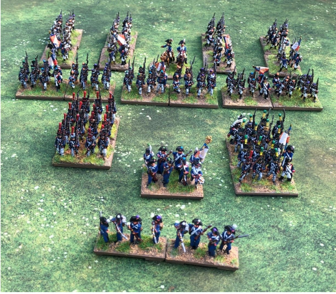
EotB Warfare 2025 Information

French infantry in Skirmishers & Supports, Columns of Attack, Line and Columns of March.